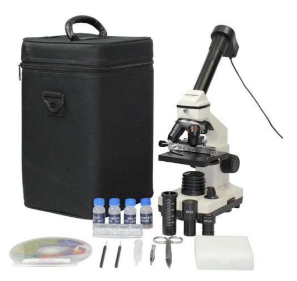
The Omegon Microstar with its extensive accessories