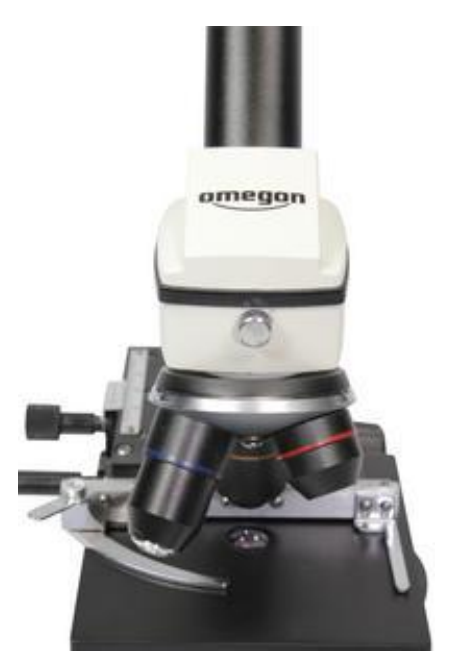
The objective turret and objectives