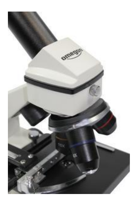
The stage and mechanical stage